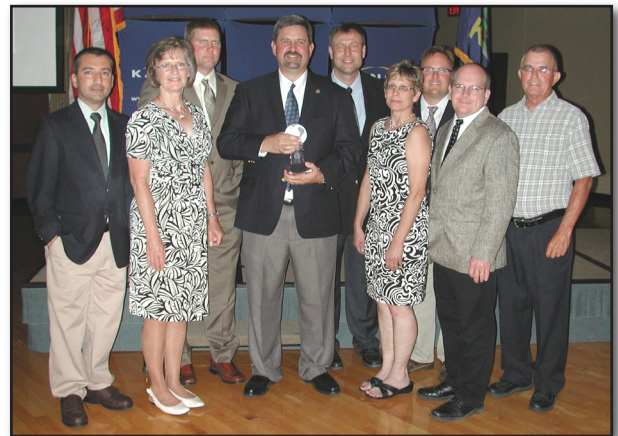
Representatives of Osborne Industries employee-owners receive the award at the Annual Kansas Cavalry Encampment

State of Kansas, June 29, 2010 - Kansas Governor Mark Parkinson presented Osborne Industries with the 2010 Kansas Governor's Exporter of the Year Award at the Annual Kansas Cavalry Encampment June 29, 2010. This award is one of the state's top business honors and brings recognition to a Kansas company that is committed to expanding sales in international markets, showcasing the awarded company as a role model to other Kansas companies seeking similar success.